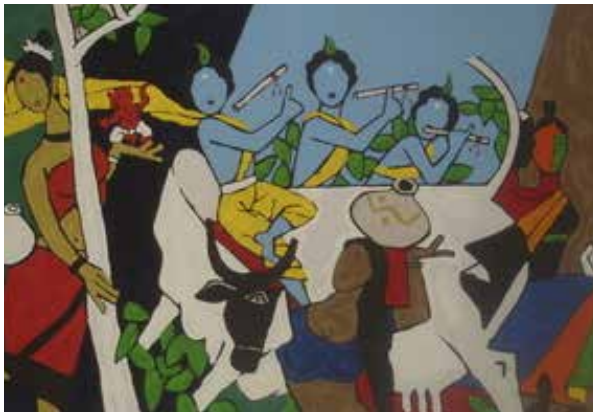
Example 4: M.F. Hussain, Krishna Leela