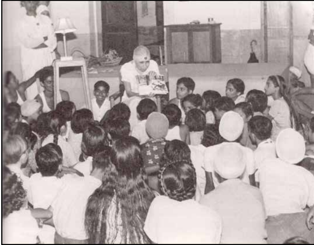
The Mother taking Class