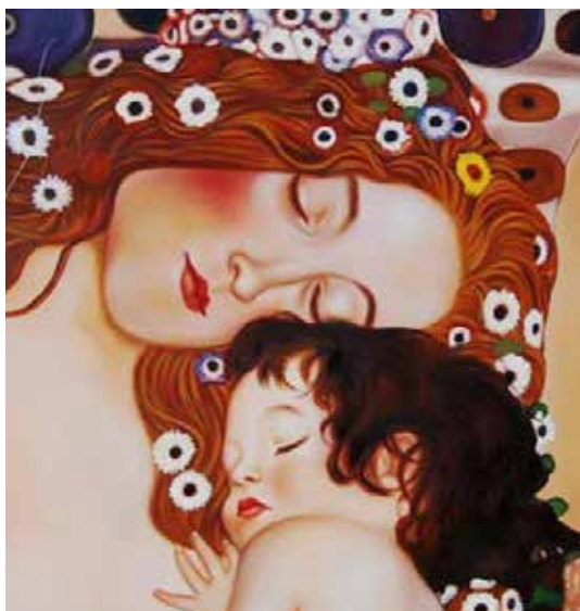
Example 1: Gustav Klimt, Mother and child