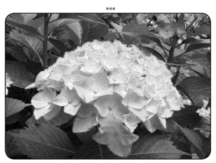
Spiritual significance of the flower: Collective Harmony