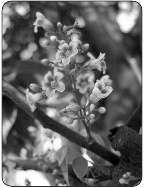
Spiritual significance of the flower: Organized teamwork

In future, do we see a similar possibility of succession planning in business organizations too?